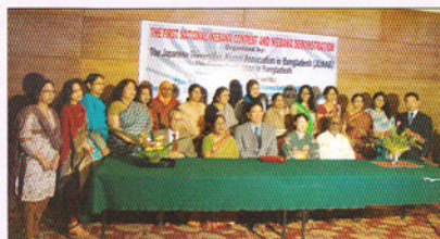
First National Ikebana demonstration and contest at hotel Lake shore, Gulshan, Dhaka