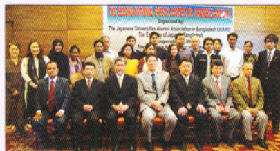
Second National Speech contest at hotel Lake shore, Gulshan, Dhaka

JUAAB Office : Suvastu Chirontoni Tower (2nd Floor) 26, Indira Road, Farmgate, Dhaka-1215.