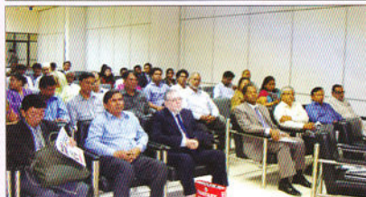
Social gathering and recently returned graduates from Japanese University at BIAM auditorium, Dhaka