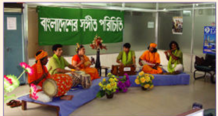
Bangladesh Folk Song Introduction ceremony at JUAAB office