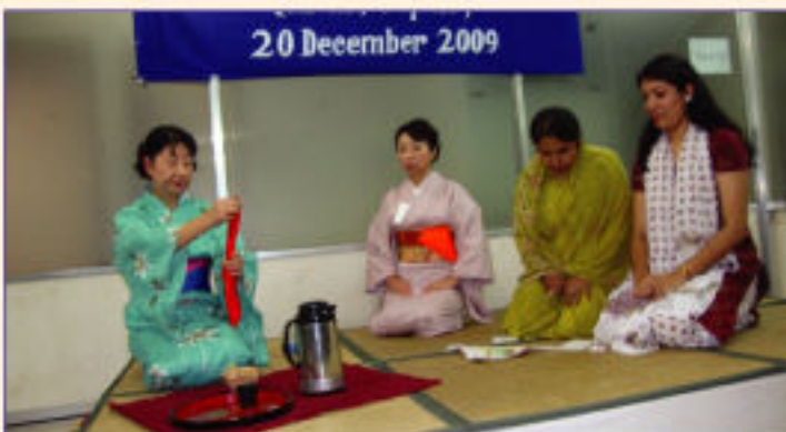
Japanese Tea ceremony and dance evening at JUAAB office