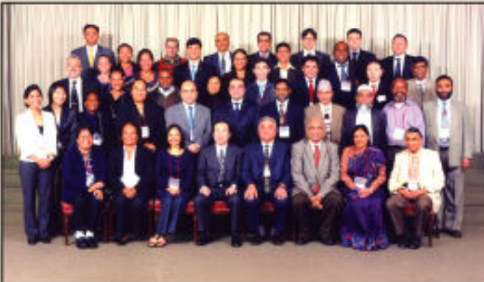
Group photo of the participating members in the Reunion