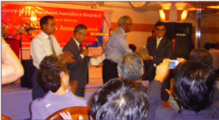
EGM held on 31st March 2009 at Xindian Restuarent, Dhaka