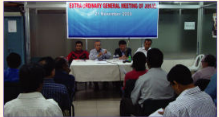
EGM held on 21st November 2009 at JUAAB office