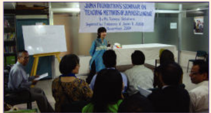
Seminar on teaching technique method of Japanese Language