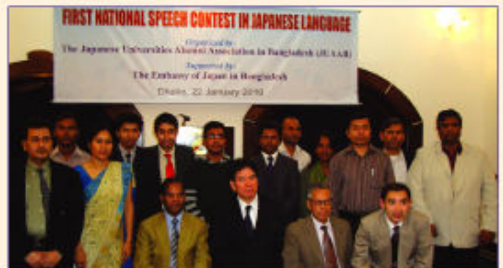
First National Speech Contest in Japanese Language at Spectra Convention Center, Dhaka

JUAAB Office : Suvastu Chirontoni Tower (2nd Floor) 26, Indira Road, Farmgate, Dhaka-1215. Tel: 914-5288, Cell: 01749-762539, Website: www.juaab-bd.org , E-mail: info@juaab-bd.org