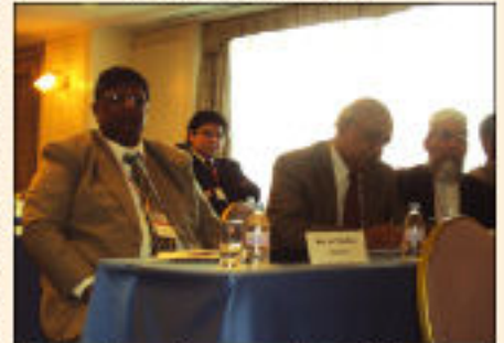
Listening to the presentation in the Reunion