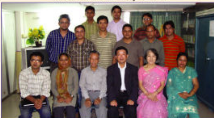
Certificate giving ceremony at JUAAB office