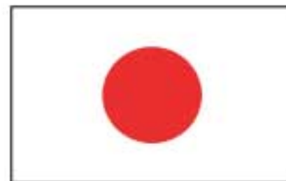
Embassy of Japan in Bangladesh

I am delighted to express my heartfelt felicitations to all the member of JUAAB on the occasion of the 20 th AGM of the Japanese Universities Alumni Association of Bangladesh (JUAAB). We are honored to have JUAAB on our side, as its steadfast commitment and hard work have helped us deepen people-to-people interactions and mutual cooperation between our two countries.