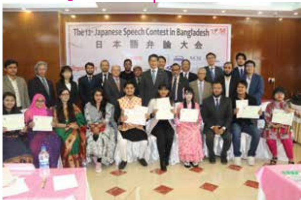
13 th National Speech Contest